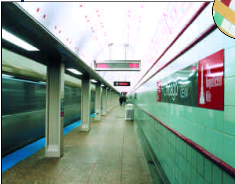
Chicago Subway installation of curved ceiling ceramic tile claddings.

Our panels have been used on the Riverbank State project which is one of the "Greatest Construction Projects" during the past 125 years of construction according to the Engineering News-Record publication, 1999.