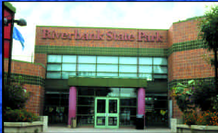
Riverbank State Park New York City, New York Ceramic Tile Cladding

Not all walls need to be smooth or straight.