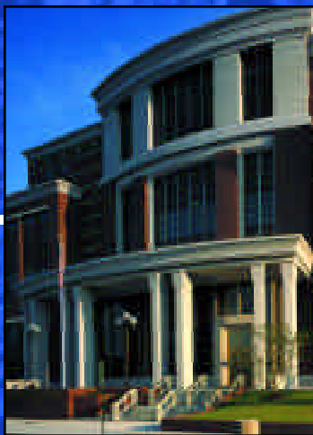
US Courthouse Covington, Kentucky Reinforced Fiberglass Panels