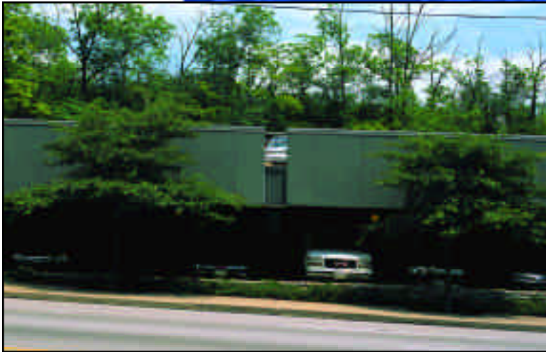
Parking Garage Cincinnati, Ohio Troweled Texture Finish

Not all walls need to be smooth or straight.